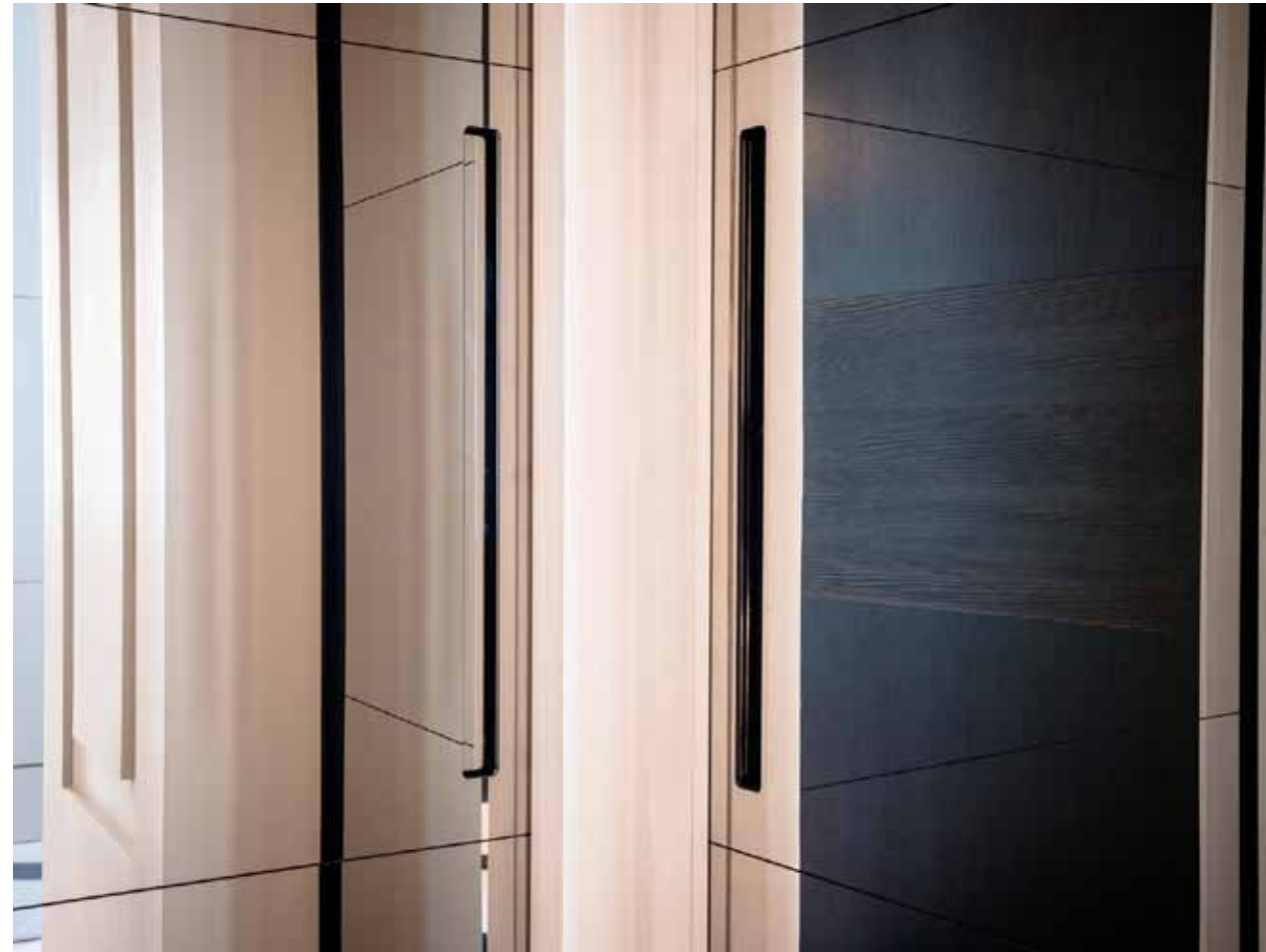
MAREA | POCKET DOOR | Recessed handle | MiraStar® Glass (Saint-Gobain) coating

Behind our work there's a hidden Italian story of experience and exclusive design. The precise technical know-how is masked by the apparent simplicity of the flush-to-wall door that, combined with a maximum level of "customization", allows fulfilling the most demanding aesthetic desires and functional expectations.