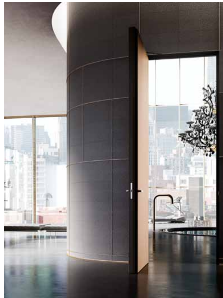
ORIZZONTE | Black shark leather finish Boiserie and skirting systems in continuity with the wall

Our widespread and well-organized network of specialized teams of installers is available countrywide; their experience and professionalism are at your service to guarantee that our products are aesthetically pleasing, functional and highly durable.