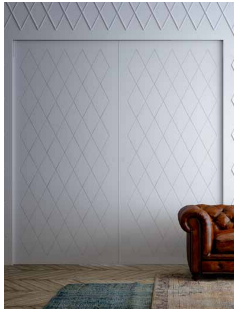
MAREA | POCKET DOOR | Double leaves version | Moulded surface Matte lacquered finish | Invisible flush fitting handle

Our widespread and well-organized network of specialized teams of installers is available countrywide; their experience and professionalism are at your service to guarantee that our products are aesthetically pleasing, functional and highly durable.